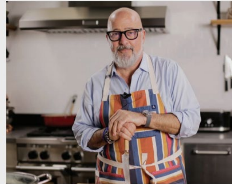
INTERVIEW WITH ANDREW ZIMMERN