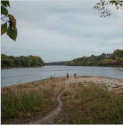
Left: Pine Island, East Smelling State Park / Photo by MN DNR. Right: Jay Cooke State Park / Photo by Explore Minnesota

There's a beauty and a peacefulness in a state park, a grounding that happens every time your foot hits the path. And, it's been proven that walking in a park lowers one's blood pressure. LINDA RADIMECKY, MN DNR